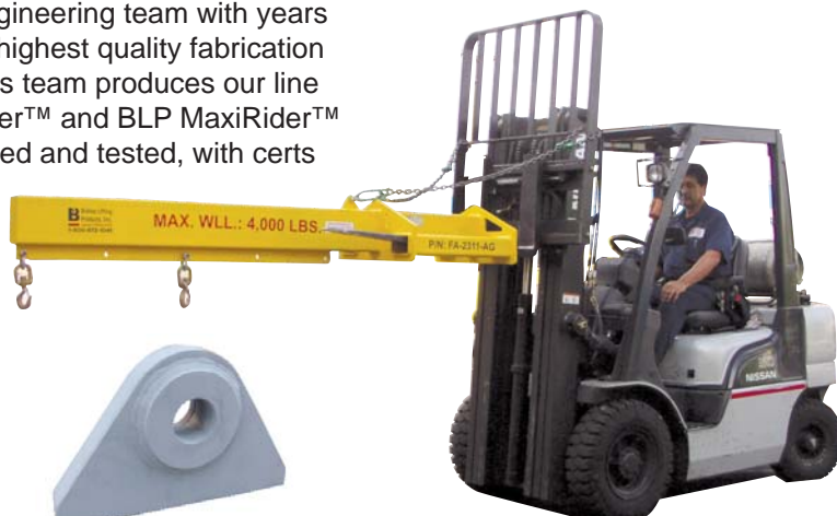
UFB Series - BLP Ultra™ Fork Lift Boom

BLP has been fabricating lifting devices for over a decade. We were the first company in Texas dedicated to satisfying the demands of heavy industry. We offer our line of BLP Ultra™ Lifting Devices for custom and standard applications. Our fabrication areas of expertise include spreader bars, lifting beams, material baskets, personnel platforms, drum and bottle lifters, pallet lifters, forklift adapters, jib cranes, lifting lugs, material handling equipment, and rigging appliances. BLP Ultra™ Lifting Devices are built to meet or exceed ASME B30.20 "Below the Hook Lifting Devices" Standards.