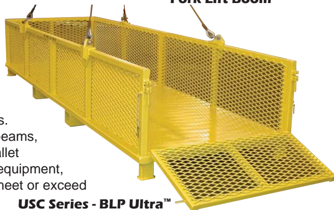
USC Series - BLP Ultra™ Scaffold Baskets